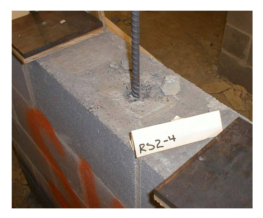
Figure 3. Typical small cone of grout that failed during testing of #4 bars