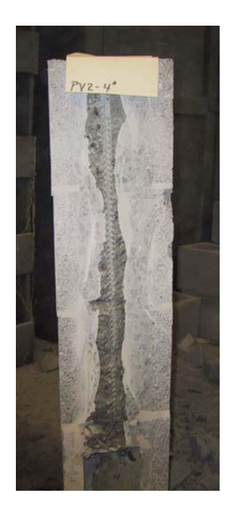
Figure 4. Wall cross-section with pencil vibrator consolidation