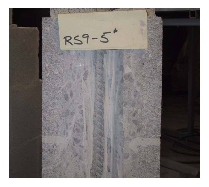
Figure 7. Wall cross-section with Oztec Rebar Shaker consolidation