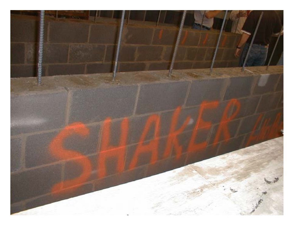
Figure 1. Completed wall prior to testing