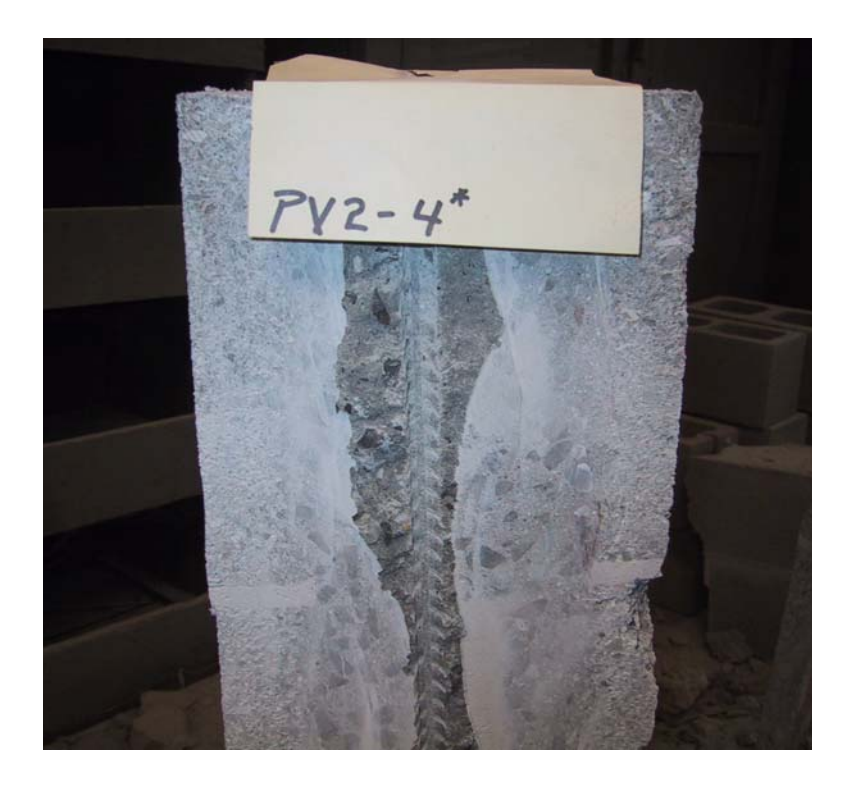
Figure 5. Wall cross-section with pencil vibrator consolidation