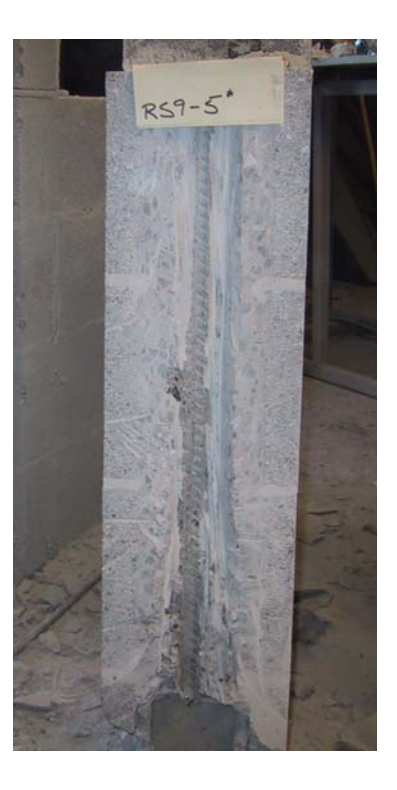
Figure 6. Wall cross-section with Oztec Rebar Shaker consolidation