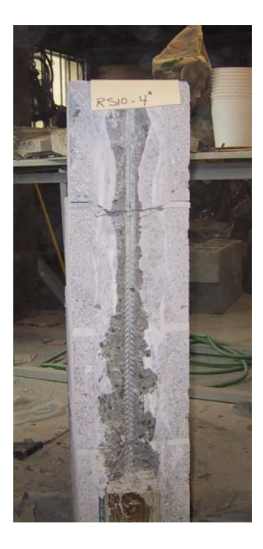
Figure 8. Wall cross-section with Oztec Rebar Shaker consolidation